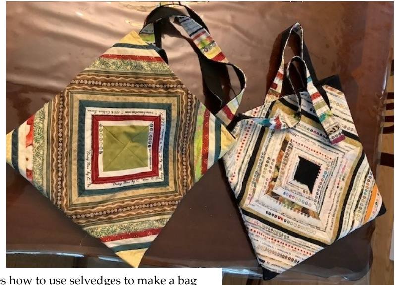
Sue teaches how to use selvedges to make a bag

Roseline taught us to sew Wonky Log Cabins