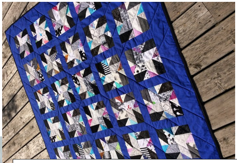
Diana Ratsep found these completed blocks on the Freebie table, put sashing around them, then quilted and bound this colourful quilt.

Sue Baldauf completed this quilt from an Outreach kit. The cheater panel made it a quick and easy one to finish. Blue and yellow are