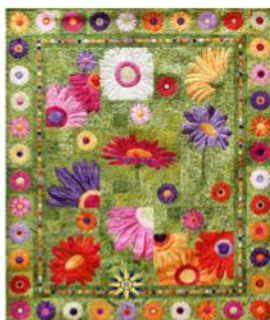
Block of the Month Check our Web Page