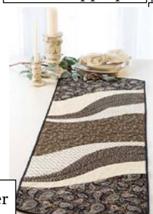
EZ Breezy Runner