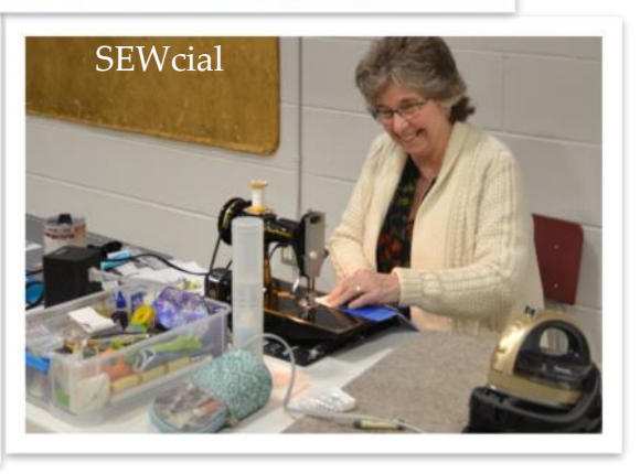
Brant Heritage Quilters Guild • Box 24025 Brantford ON N3R 7X3 • <a href="www.BrantHeritageQuiltersGuild.com">www.BrantHeritageQuiltersGuild.com</a> • <a href="https://www.facebook.com/groups/BrantQuiltersGuild/">www.BrantHeritageQuiltersGuild.com</a> • <a href="https://www.facebook.com/groups/BrantQuiltersGuild/">https://www.facebook.com/groups/BrantQuiltersGuild/</a> St. George United Church, 9 Beverly St E, St George, ON N0E 1N0