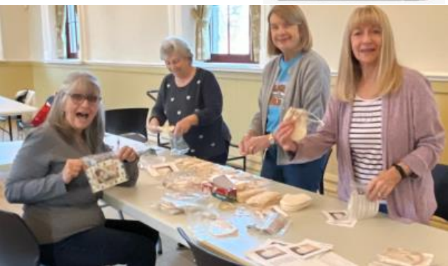
Preparing kits for December's Project