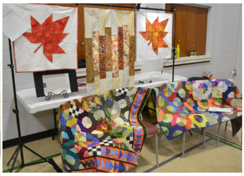
January Workshop—Pojagi—Korean patchwork - on top. February workshop samples on bottom.