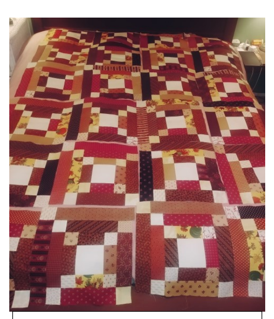
Here is a project I am working on, when I am not doing masks—it is a signature wedding quilt.