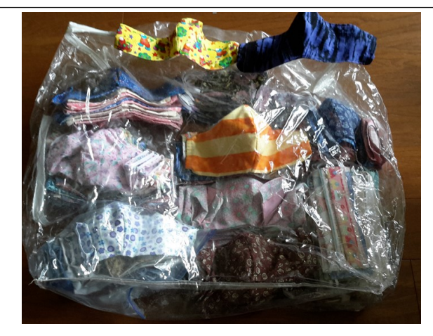
Outreach and its masks for delivery