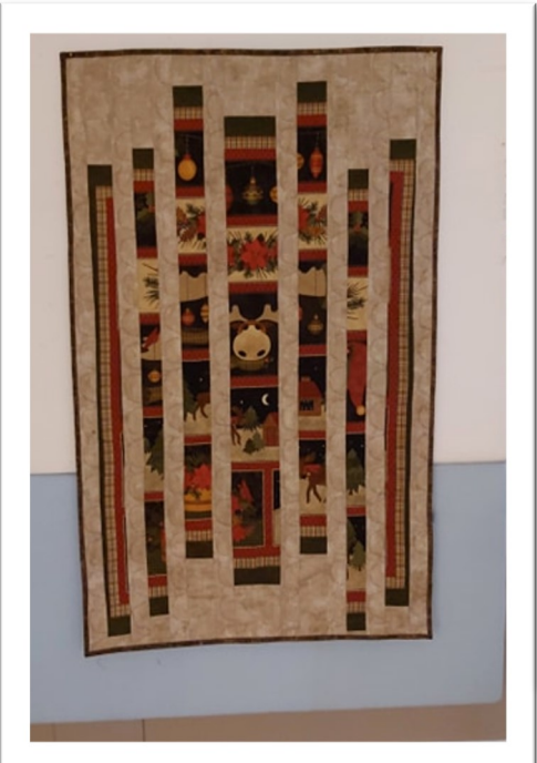
Moose Panel by Gwen Brewer