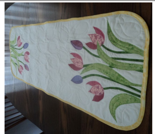
Table Runner by Lorraine Giraldi

When we meet again in September, we hope that all of you will have a finished project to present at the guild meeting. What a fun Show and Tell it will be.