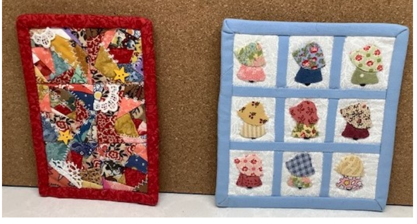
Brant Heritage Quilters Guild • Box 24025 Brantford ON N3R 7X3 • <a href="www.BrantHeritageQuiltersGuild.com">www.BrantHeritageQuiltersGuild.com</a> • <a href="https://www.facebook.com/groups/BrantQuiltersGuild/">https://www.facebook.com/groups/BrantQuiltersGuild/</a> St. George United Church, 9 Beverly St E, St George, ON N0E 1N0