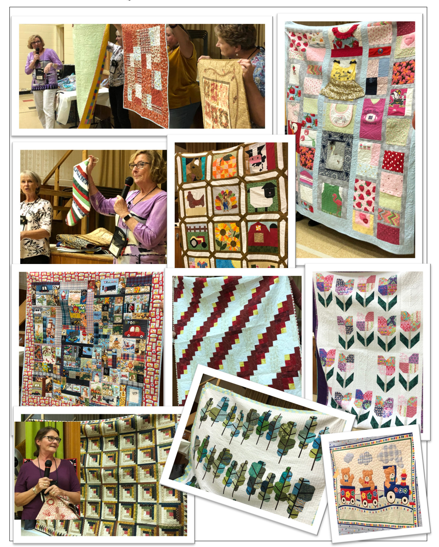
Brant Heritage Quilters Guild • Box 24025 Brantford ON N3R 7X3 • <a href="www.BrantHeritageQuiltersGuild.com">www.BrantHeritageQuiltersGuild.com</a> • <a href="https://www.facebook.com/groups/BrantQuiltersGuild/">www.BrantHeritageQuiltersGuild.com</a> • <a href="https://www.facebook.com/groups/BrantQuiltersGuild/">https://www.facebook.com/groups/BrantQuiltersGuild/</a>