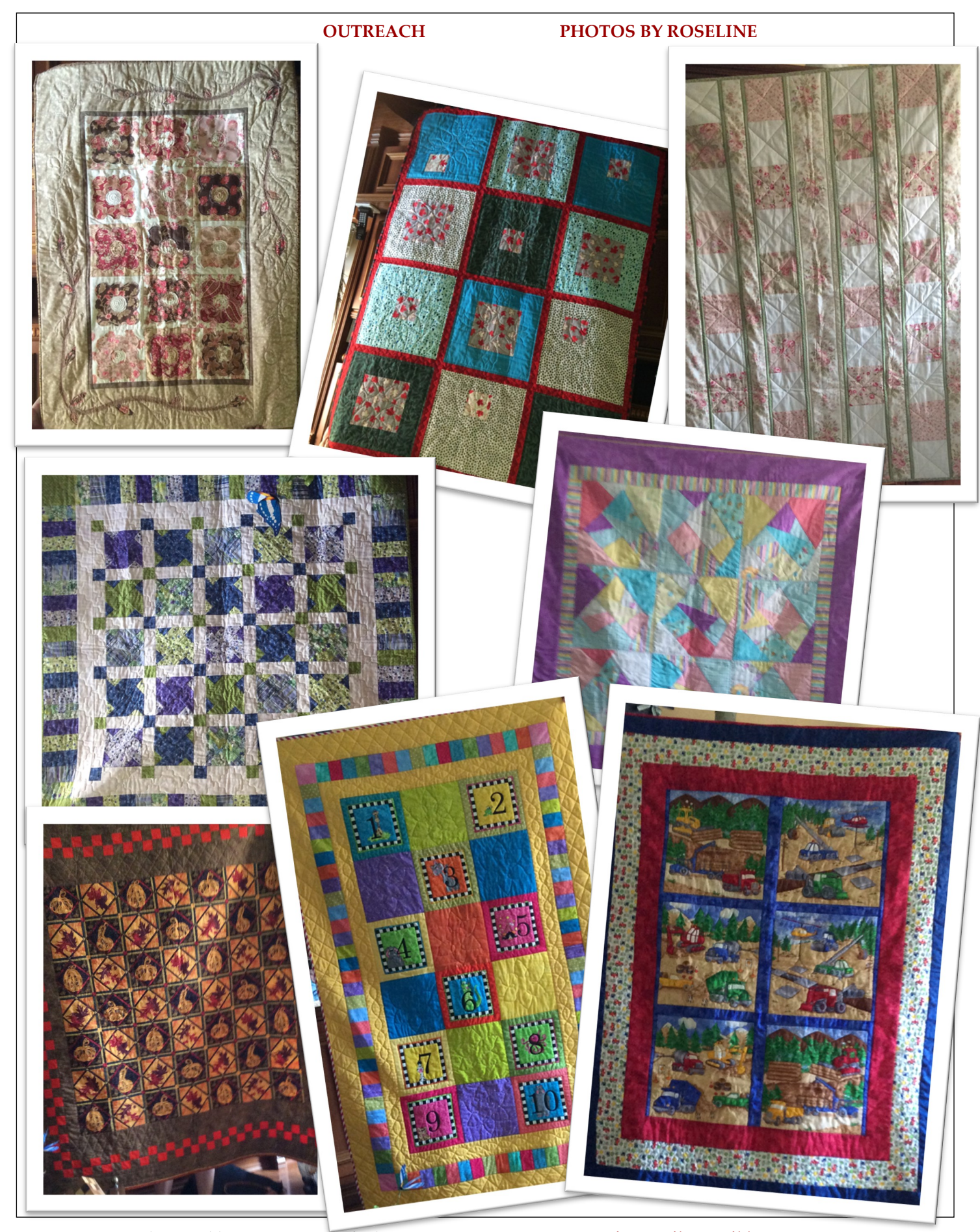
Brant Heritage Quilters Guild • Box 24025 Brantford ON N3R 7X3 • <a href="www.BrantHeritageQuiltersGuild.com">www.BrantHeritageQuiltersGuild.com</a> • <a href="www.facebook.com/groups/BrantQuiltersGuild/">www.facebook.com/groups/BrantQuiltersGuild/</a>