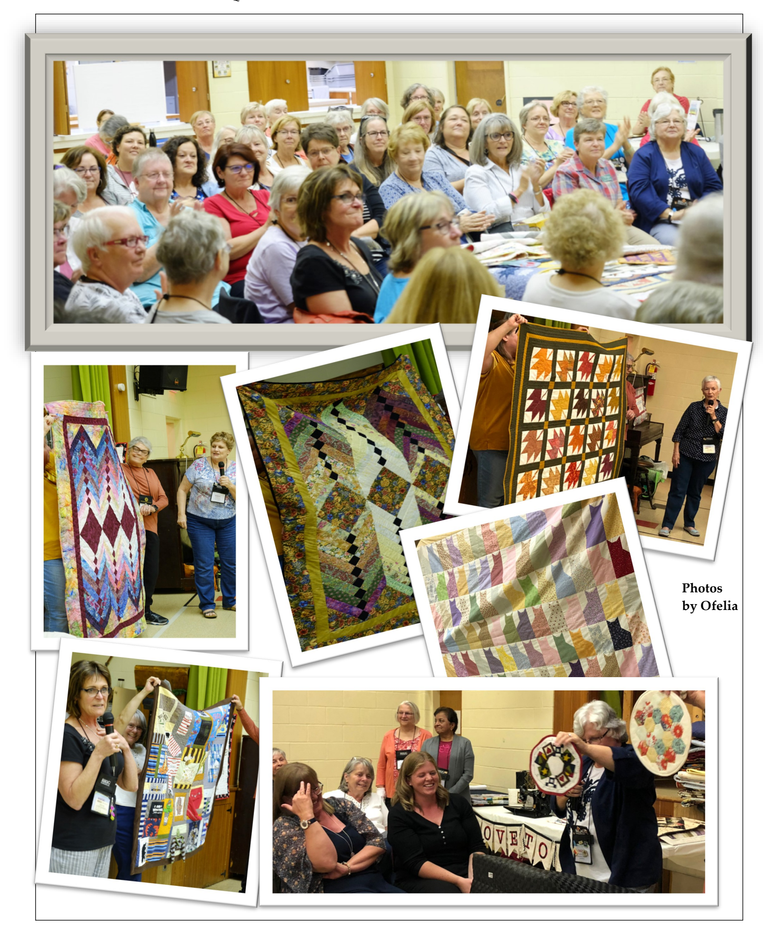
Brant Heritage Quilters Guild • Box 24025 Brantford ON N3R 7X3 • <a href="www.BrantHeritageQuiltersGuild.com">www.BrantHeritageQuiltersGuild.com</a> • <a href="mailto:mww.facebook.com/groups/BrantQuiltersGuild/">mww.facebook.com/groups/BrantQuiltersGuild/</a> • <a href="mailto:mww.facebook.com/groups/BrantQuiltersGuild/">mww.facebook.com/groups/BrantQuiltersGuild/</a>