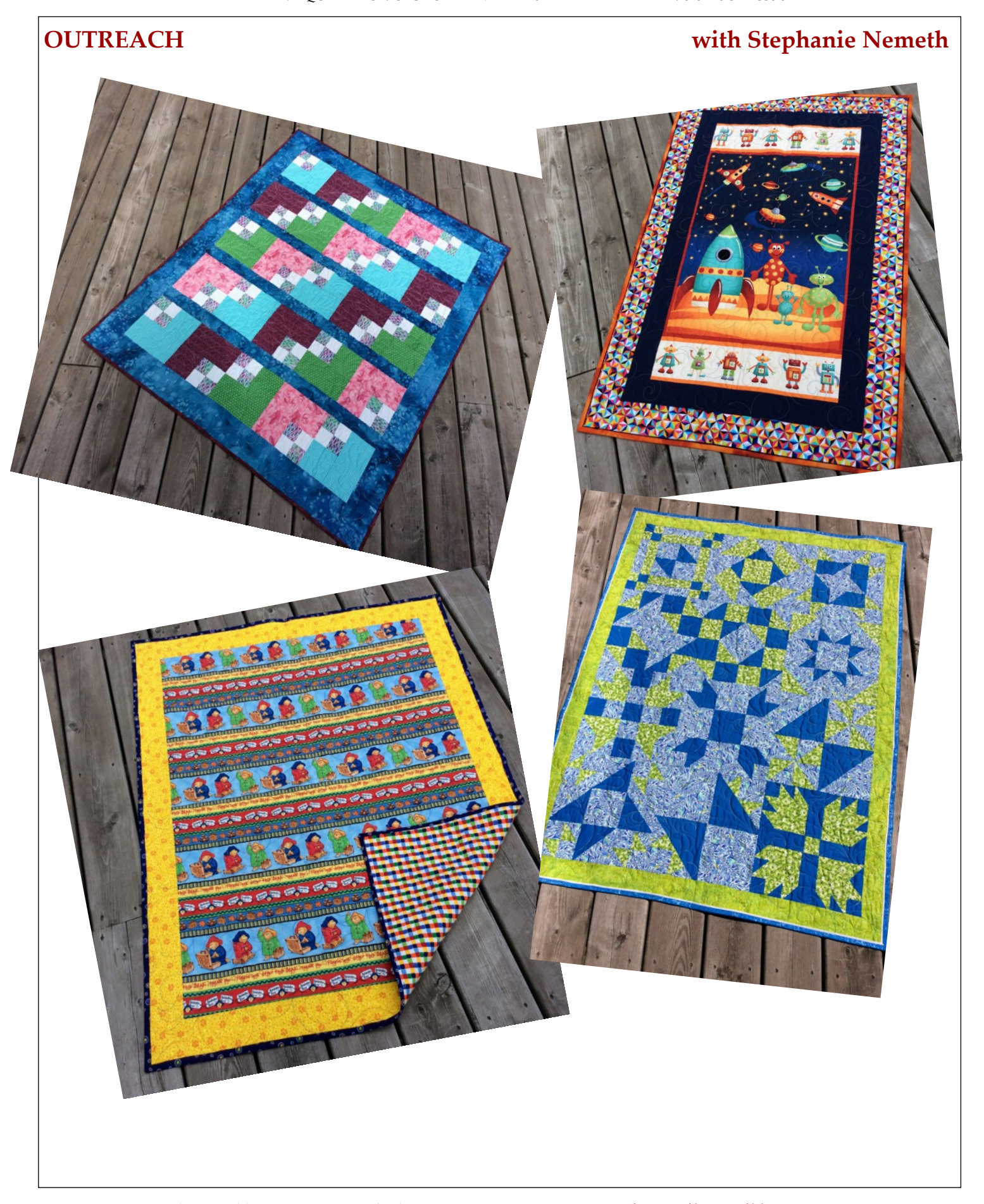
Brant Heritage Quilters Guild • Box 24025 Brantford ON N3R 7X3 • <a href="www.BrantHeritageQuiltersGuild.com">www.BrantHeritageQuiltersGuild.com</a> • <a href="https://www.facebook.com/groups/BrantQuiltersGuild/">https://www.facebook.com/groups/BrantQuiltersGuild/</a> St. George United Church, 9 Beverly St E, St George, ON N0E 1N0