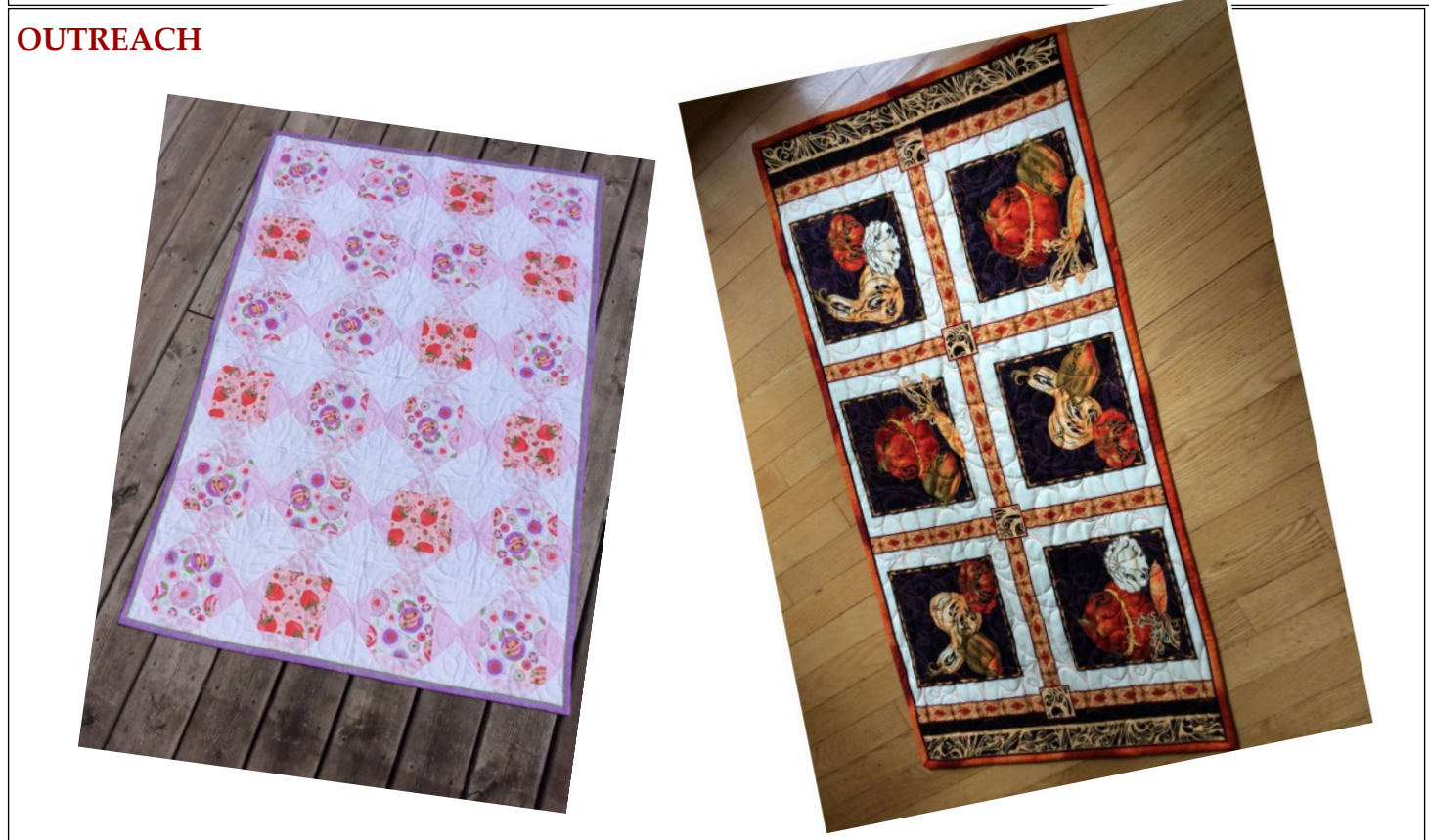
Brant Heritage Quilters Guild • Box 24025 Brantford ON N3R 7X3 • <a href="www.BrantHeritageQuiltersGuild.com">www.BrantHeritageQuiltersGuild.com</a> • <a href="https://www.facebook.com/groups/BrantQuiltersGuild/">https://www.facebook.com/groups/BrantQuiltersGuild/</a> St. George United Church, 9 Beverly St E, St George, ON N0E 1N0